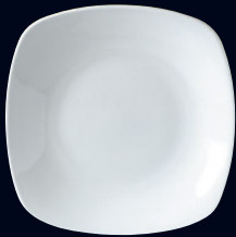
Metro Plate 9001C082 L W 11" 9001C084 L W 9" 9001C083 L W 7" 9001C078 L W 5 1/2"