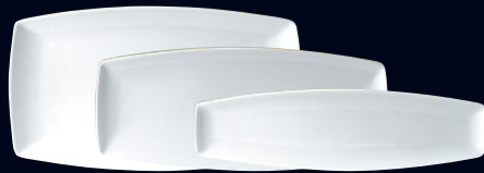
Neo Tray 9001C087 L 14" W 8" 9001C086 L 14" W 6" 9001C085 L 14" W 4"