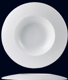
Float 9001C600 D 12" (Well 7 1/2") (19 oz)

Appearing to hover just above the tabletop, the unconventional Float creates a new perception of food service, literally suspending belief. A stunning contemporary shape, Float is designed to draw the eye to the dish nestling within its center. With the gentle curve of the rim gradually dipping away, the focus is always on the food.