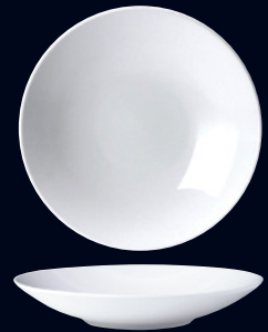
Contour Bowl 9001C094 D 11 3/4" (59 oz) (Plate Cover 5379S805) 9001C1142 D 11" (47 oz) (Plate Cover 5379S792) 9001C095 D 10" (34 1/2 oz) (Plate Cover 5379S806) 9001C096 D 8" (20 oz) 9001C097 D 6" (8 3/4 oz)