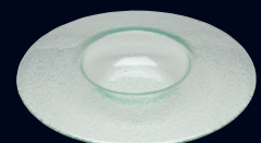
Glass Float 6506G244 D 11" (Well 5") (8 oz)