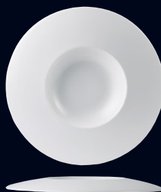
Float 9001C601 D 12" (Well 6") (13 oz)