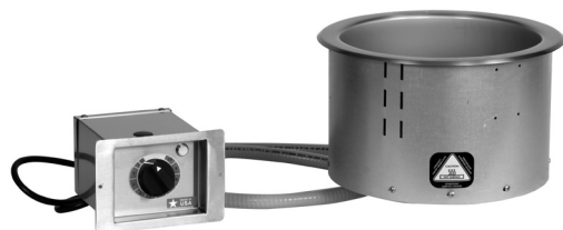
1100-RW (Insert pan not included)