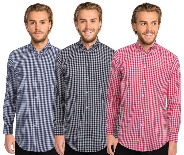
3.2 oz. yarn-dyed 65/35 poly/cotton, button-down collar, long-sleeve with 2-button cuffs, double back yoke with box pleat, buttoned front, left chest pocket