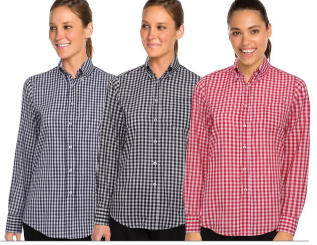
3.2 oz. yarn-dyed 65/35 poly/cotton, button-down collar, long-sleeve with 2-button cuffs, double back yoke with box pleat, buttoned front, left chest pocket