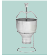
APCD-6 & APCD-6R