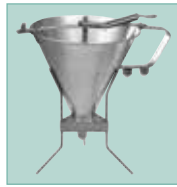
SF-7 & SF-7r