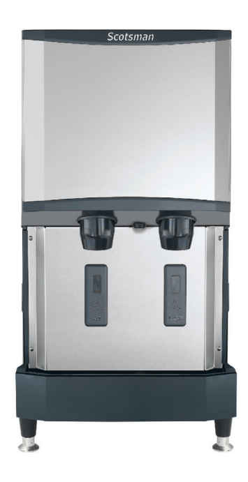
Shown with optional KLP24A legs