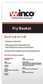
Packaging lists the models that each FB- item fits