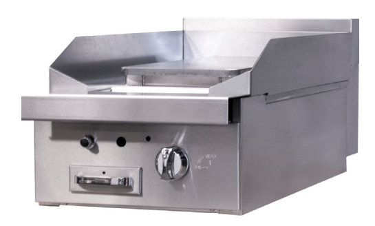
Model P16N-P shown

** PLANCHA UNITS DO NOT ALLOW SPECIFIC TEMPERATURE OPERATION **