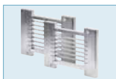
OS-250B Blade set assembly