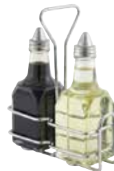
WH-3 Use rack with G-104