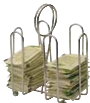
WH-2 Fits standard sweetener packets