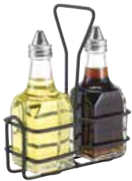
WH-3K Use caddy with G-104