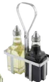
WH-5 Use rack with G-104