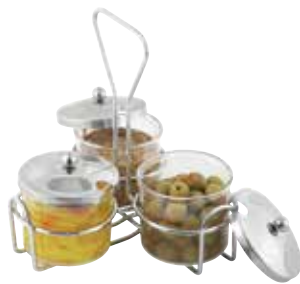
WH-4 Use holder with CJ-Series condiment jars