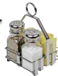
WH-7 Use rack with G-109