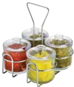
WH-9 Use holder with CJ-Series condiment jars