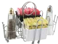
WH-1 Use holder with PPH-Series packet holders, and G-110 / G-111 shakers