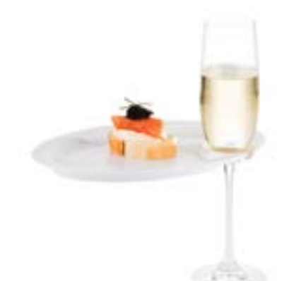
plate with glass holder