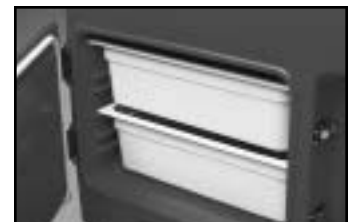
Two insulated holding compartments each hold up to 4 each GN 1/1 Full Size 6" (15 cm) deep Food Pans.