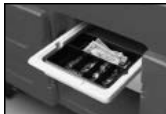
Open holding compartment holds cash drawer and box. (included)