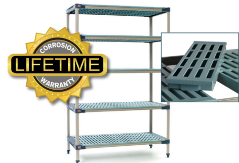
Five Tier Starter Unit