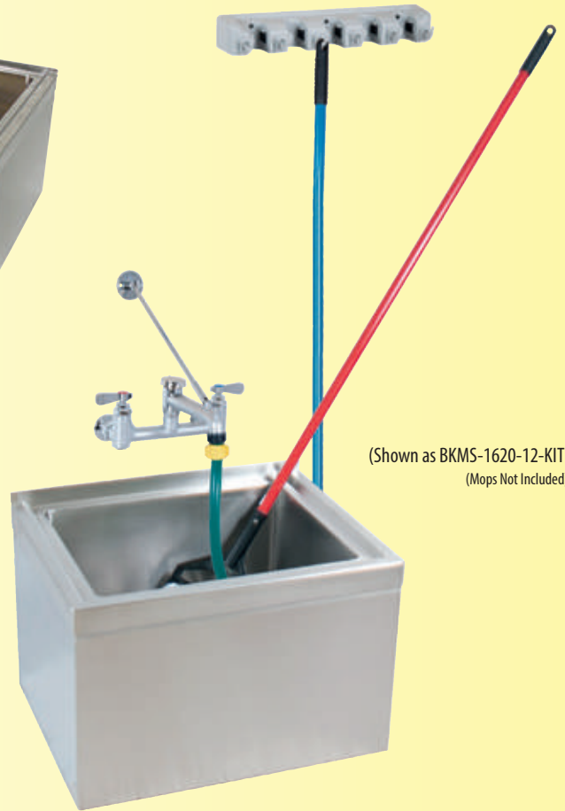
(Shown as BKMS-1620-12-KIT) (Mops Not Included)