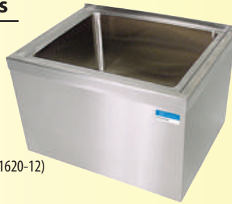
(Shown as BKMS-1620-12)