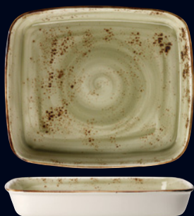
Oblong Roaster 0331 L 14" W 12" (125 oz) 0342 L 12" W 10" (80 oz)