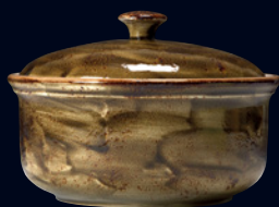
Casserole 0337 3 (104 oz) Lid 0338 3