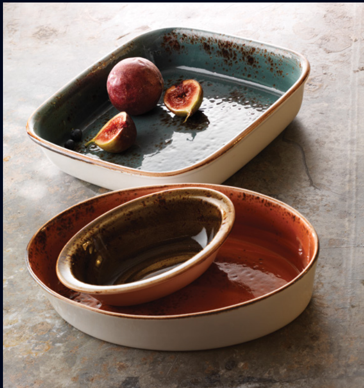
Assorted Craft Roasters and Bakers