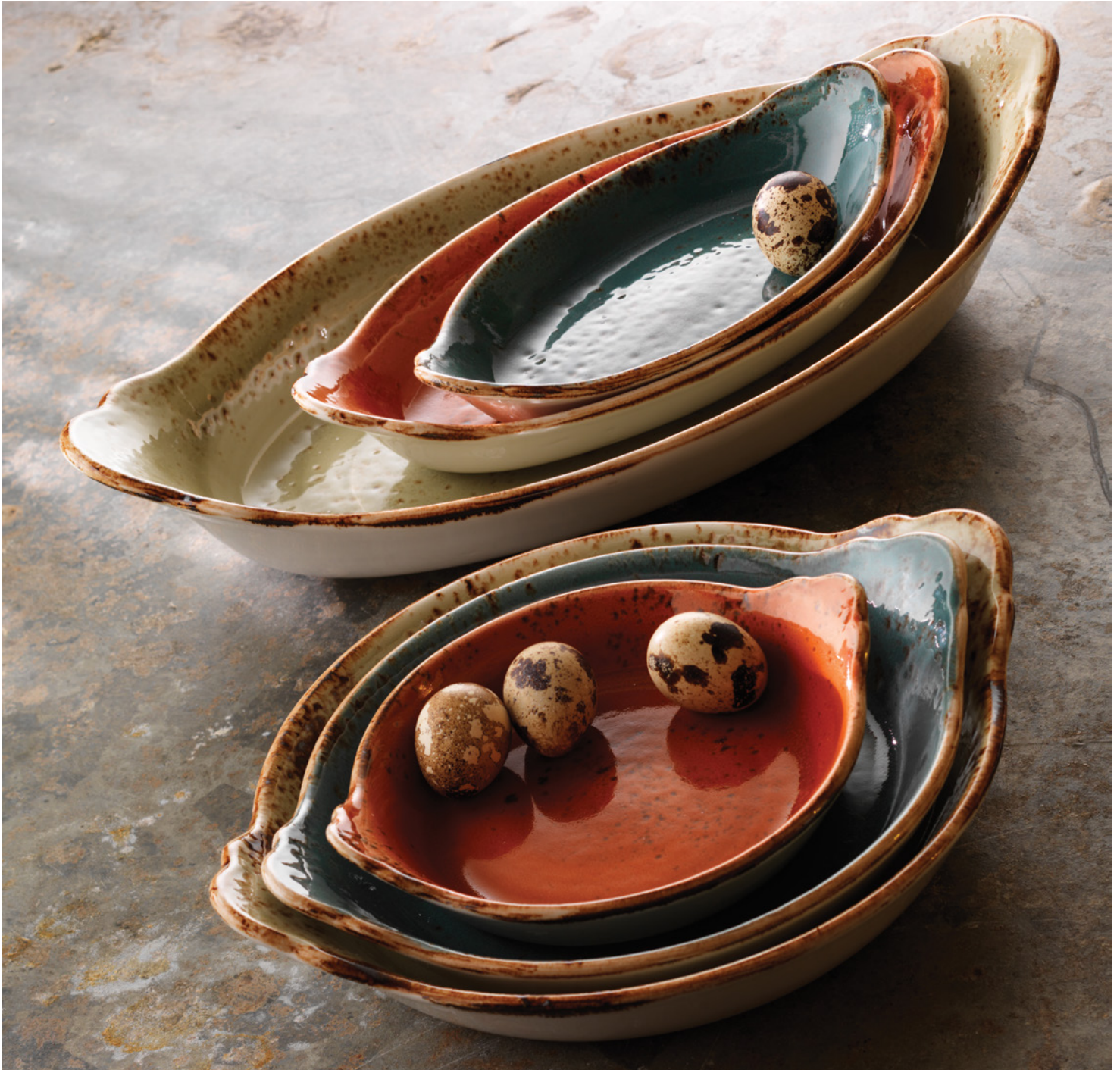
Assorted Craft Oval and Round Eared Dishes