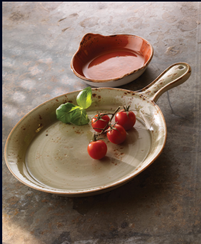
Presentation Pan 11310866 D 10" (33 1/2 oz) Round Eared Dish 11330317 D 8 1/2" (27 oz)