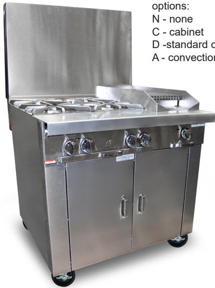
Model P36C-BBC with optional 24" flue riser

*All configurations available with the following oven base options: