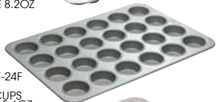
HMF-24F 24 CUPS TEXAS 5.6OZ