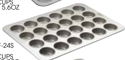
HMF-24S 24 CUPS JUMBO 7OZ