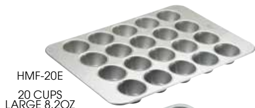
HMF-20E 20 CUPS LARGE 8.2OZ