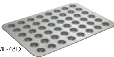
HMF-48O 48 CUPS MINI 1.1OZ