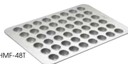
HMF-48T 48 CUPS MINI 2.1OZ