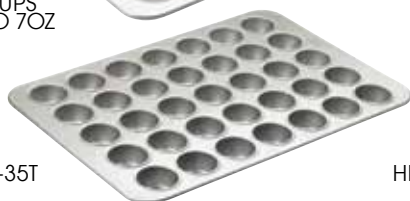
HMF-35T 35 CUPS CUPCAKE 3.8OZ