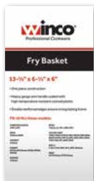
Packaging lists the models that each FB- item fits