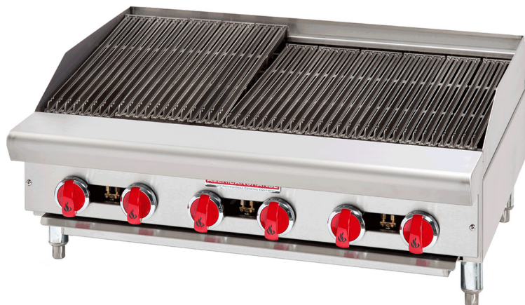
Model Shown ARSRB-36