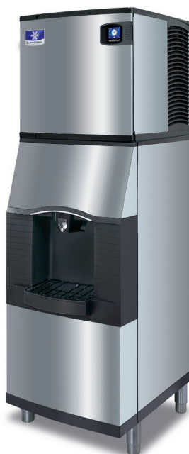
Indigo NXT iT0620 Ice Machine SPA-160 Ice Dispenser

With Indigo and Indigo NXT ice machines you can program the ice machines to be off certain hours of the day so that while the hotel guests are sleeping, the ice machine can be too!