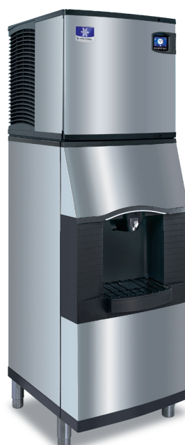
Indigo NXT iT0620 Ice Machine SFA-191 Ice & Water Dispenser