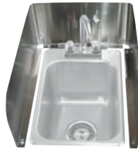
Sink Sold Separately