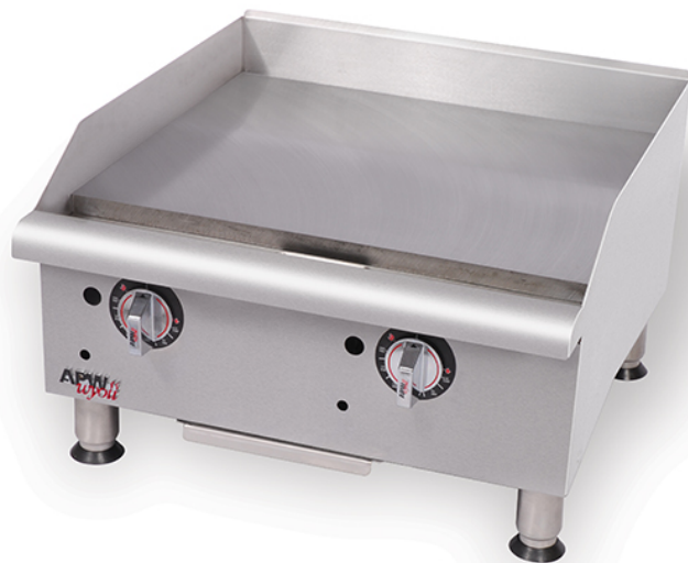
Model GGM-24i Gas Manual Griddle