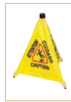
Set includes pop-up "Caution" cone