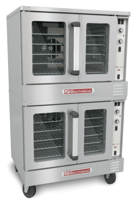
SLGS/22SC shown with optional casters

OPTIONAL NRG System required for rebates. NRG System units are Energy Star Approved. (Standard Depth Only)