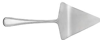
Pie Server V012MPSF / T012MPSF (11½"/29.2 cm), 1 doz