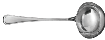
Soup Ladle V012MSPF / T012MSPF (12"/30.5 cm), 1 doz 8½ oz / 25.1 cl