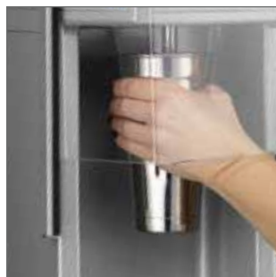
Ergonomic Splash Guard