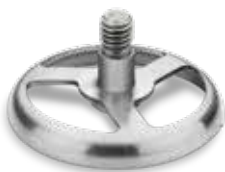
WDM500MA Solid Metal Agitator for use with hard ice cream