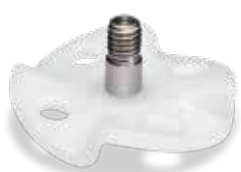
WDM500PA Butterfly Plastic Agitator for use with soft serve, yogurt and gelato