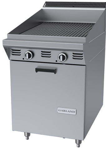
Model MST24BE Shown with Optional Backguard