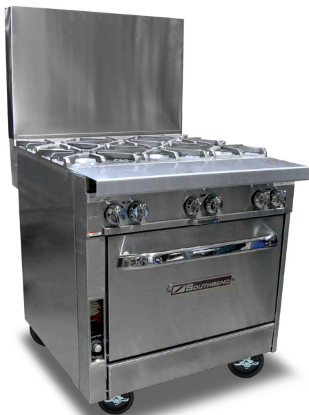
Model P32A-BBB shown with optional 24" flue riser and casters