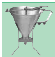
SF-7 & SF-7R