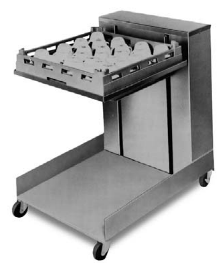
Model: Cantilever Glass & Tray Mobile Dispenser