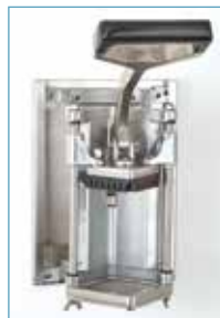
Wall mounted with HFC-BK