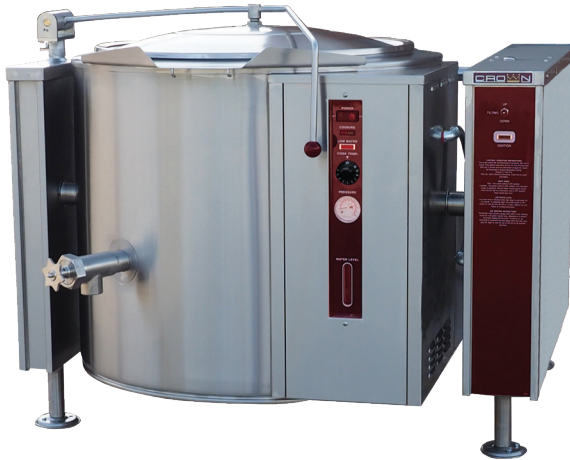
Shown with optional spring assist cover