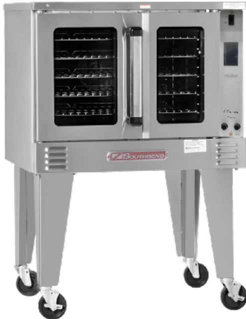
PCE75B/T shown with optional casters