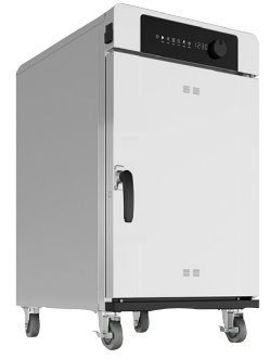
Shown with Simple control