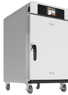
Shown with Deluxe control