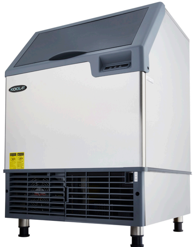
Half Cube Dimensions