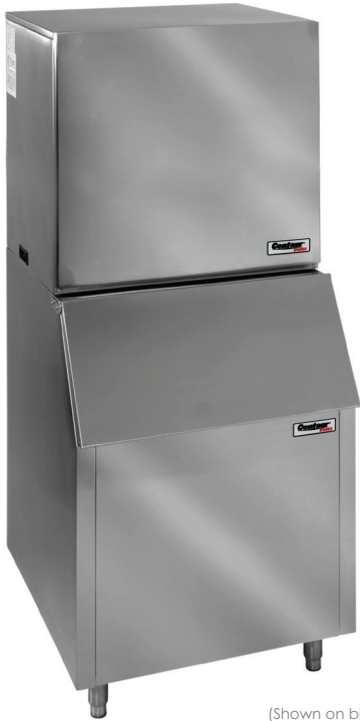
(Shown on bin, model CIB400, which is not included.) Model CIB400 dimensions: 30" W x 31 1/2" D x 40" H 762mm W x 800mm D x 1016mm H