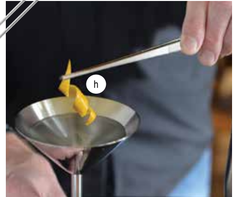
Ergonomic design includes textured grip for ease of use and control while delicately placing fruit peels, fresh herbs or chocolate swirls