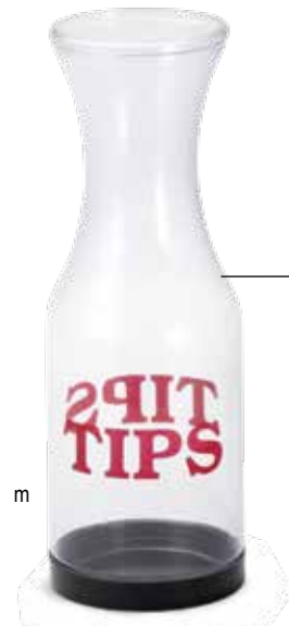
SAN Plastic container with twist-off bottom