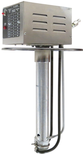
General image shown for reference.