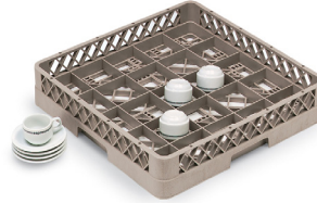
TR16 25-COMPARTMENT 3 7/16" (9 cm) sq. compartment 4 15/16" (12.5 cm) diagonal