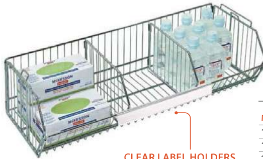
1436BC Shown with Dividers and Clear Label Holder (Sold separately)

Offer a variety of storage, display and mobile supply applications. Dividers can be used to separate product. Accessible front and a wide selection of sizes allow for all types of product to be used from storage to display. (Dividers sold separately) Finish: Chrome