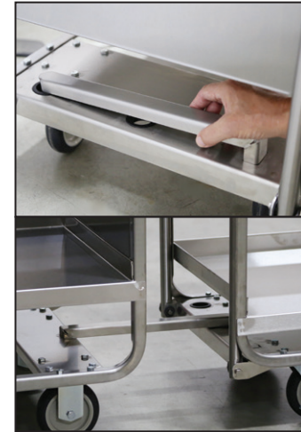
Optional On-Board Hitch Bar