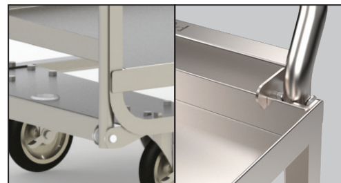
Hinged handle locks securely in upright position.