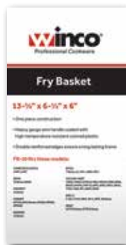
Packaging lists the models each FB item fits