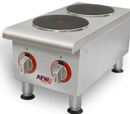
Model EHPi Electric Hot Plate