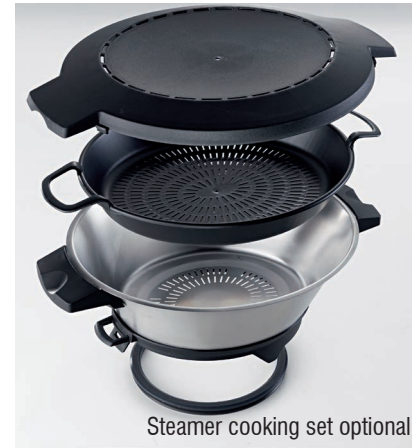
Steamer cooking set optional