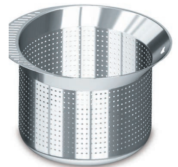
Pierced basket optional