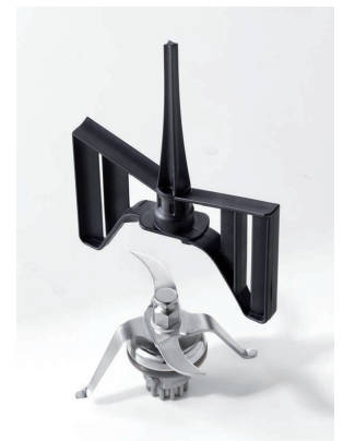
Butterfly mixer and knife hub