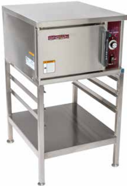
SX-3 shown on optional stand