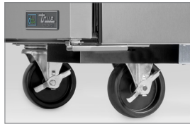
Standard 5" Castors