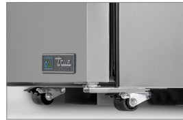
Low Profile (LP) 1 1/2" Castors Upcharge applies for (LP) size castors

Door or drawer assemblies can be located in any section of the cabinet. Location of door/drawers must be indicated at time of ordering.