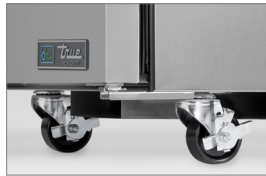
ADA 3" Castors