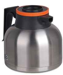
CARAFE, SST 1.9L SHRT ORN 12/