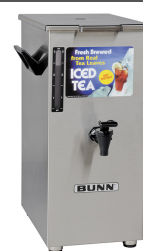
TD4T, SIGHT GAUGE NUDGER HDL