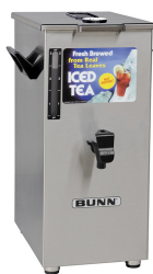
TD4T, W/BREW THRU LID & LIFT HANDLE