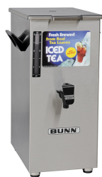
TD4T, W/ LIFT HANDLE