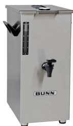
TD4T, BREW THRU LID NO DECAL NUDGER HDL