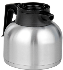
CARAFE, SST 1.9L SHRT BLK 12/