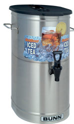
TDO-4, RESERVOIR BREW THRU