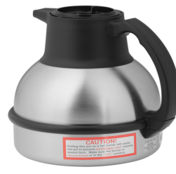
THERMAL CARAFE, ORN 1.9L 12PK