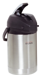
AIRPOT, 2.5L SST LA 6/ CASE