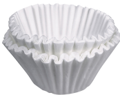
FILTERS TEA/SYS2 500PK/1 50/CL Product #: 20100.0000