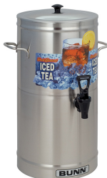
TDS-3, 3 GAL