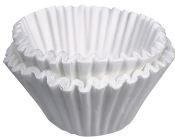
PAPEL FILTRANTE Product #: 20100.0000