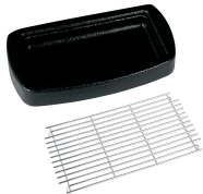
CHAROLA CON ACCESORIOS Product #: 38029.1002