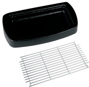
DRIP TRAY KIT, ITB W/2 TDO-N-3.5 Product #: 38029.1002