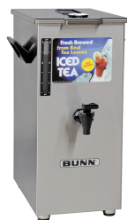
TD4T, BREW THRU LID NUDGER HDL