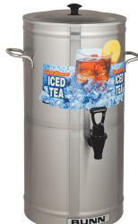
TDS-3.5, 3.5 GAL