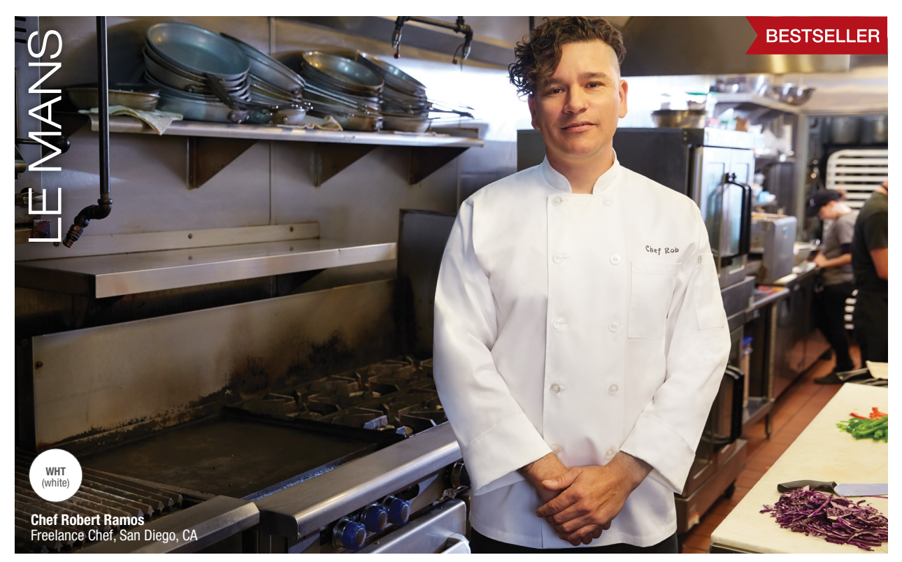
6.2 oz. 65/35 poly/cotton, turn-back cuffs, matching buttons, left chest patch & thermometer pockets, women's fit available (see pg 62) Available in WHT