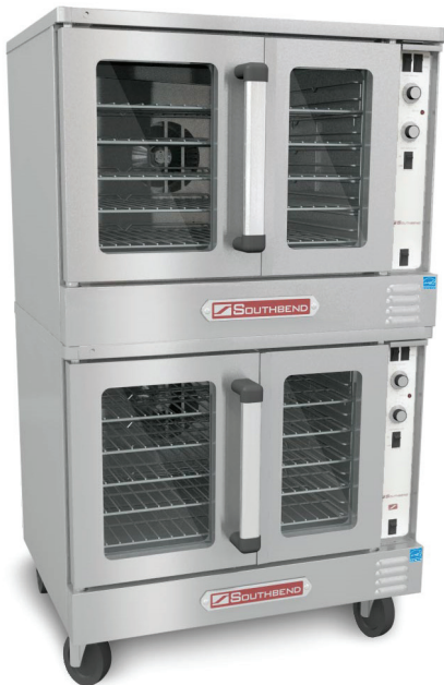
BGS/23SC shown with optional casters