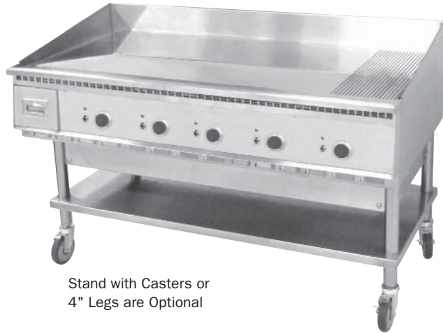
Stand with Casters or 4" Legs are Optional

The Keating MIRACLEAN® Griddle is designed to provide maximum performance with many benefits to the operator. The mirror surface is achieved in a special eight step process. Insulated stainless steel electric elements are mounted every 12" to ensure performance and recovery allowing the operator to use zone cooking for different products.