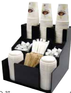
CLSO-3T 12-5/16"L x 12-3/4"W x 13-1/8"H