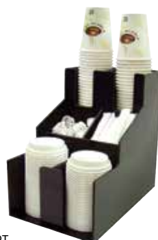
CLSO-2T 8-1/2"L x 13-1/16"W x 12-3/16"H